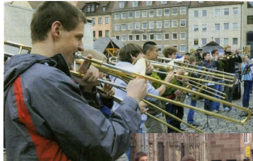
Dunwoody High School Band plays in the Nürnberg Main Market Square

❖ While in Nürnberg, the students performed twice – once for the Mayor of Nürnberg in the Main Market Square, and then in a joint concert with the band from their host high school – Eckental Gymnasium. Also during their stay, the group visited the Nürnberg Document Center, a museum containing details of the Nürnberg Trials and chronicling the Nazi's rise to power in the 1920s and 30s. They also traveled to the old Roman City of Regensburg, and the medieval City of Bamberg.