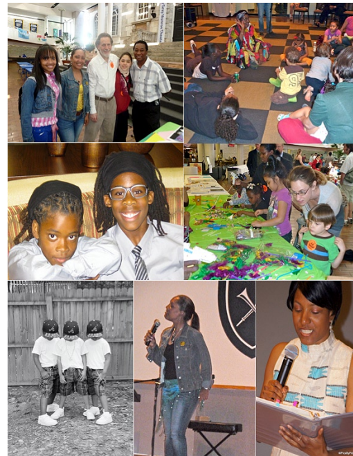
Global Health and Humanitarian Summit

❖ Committee members were actively involved in the Global Health and Humanitarian Summit held at Emory University on April 02 and 03. The goal of the Summit is to inspire individuals (including children) and organizations to become active in humanitarian volunteerism. The organizers hope to catalyze an international movement,