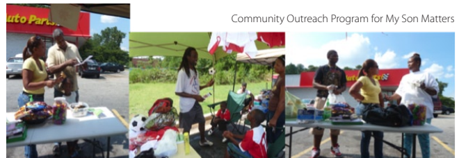
Community Outreach Program for My Son Matters