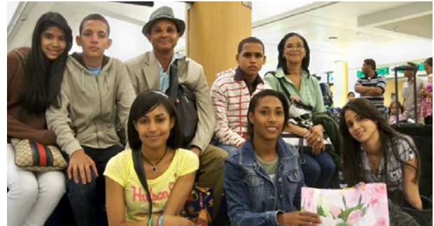
Participation of the Atlanta-Salcedo Sister Cities Committee – ASSCC – in the 2011 Super Student Exchange organized by the Atlanta Sister Cities Commission – ASSC. A delegation of 6 students, a teacher, and a Salcedo City Councilmember arrived at the Hartsfield-Jackson Atlanta Airport on October 2011.