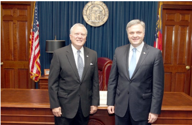
Governor Deal with Georgia's Vice Prime Minister, Mr. Baramidze.

❖ In March, the Georgia to Georgia Foundation and the Ministry of Internal Affairs donated a large number of books and textbooks to the Library of International Relations Main Division in Tbilisi. The exchange was aimed at deepening cooperation and cultural dialogue between Atlanta and Tbilisi.