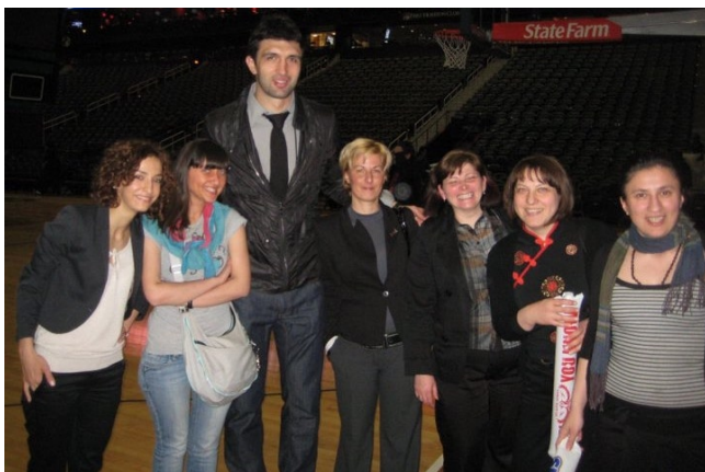
Delegation of Georgian journalists with Georgia native Zaza Pachulia of the Atlanta Hawks

❖ In September, ATSCC and the Georgia to Georgia Foundation hosted an Open World Leadership Delegation. A group of five Georgia attorneys met with members of the Federal and state judiciary, witnessed court proceedings, and discussed pertinent legal issues with academics, attorneys, and legislators. The trip was designed to teach delegates about the rule of law in an attempt to further ongoing legal reform efforts in the Country of Georgia.