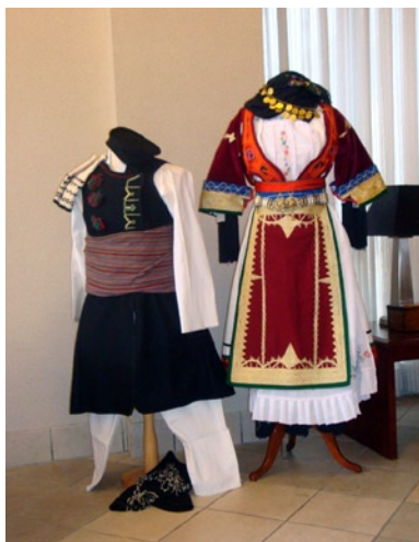
Greek costume display

❖ The FSA International Heritage Festival was held at the Verizon Wireless Amphitheatre at Encore Park in April of this year. The Ancient Olympia Greece committee was a proud sponsor for the Greece booth which featured artifacts from the region as well as a few authentic costumes. The committee also sponsored the Lykion Ton Ellinidon dance students of Atlanta who perform to showcase the Hellenic Folk Dances from Greece.