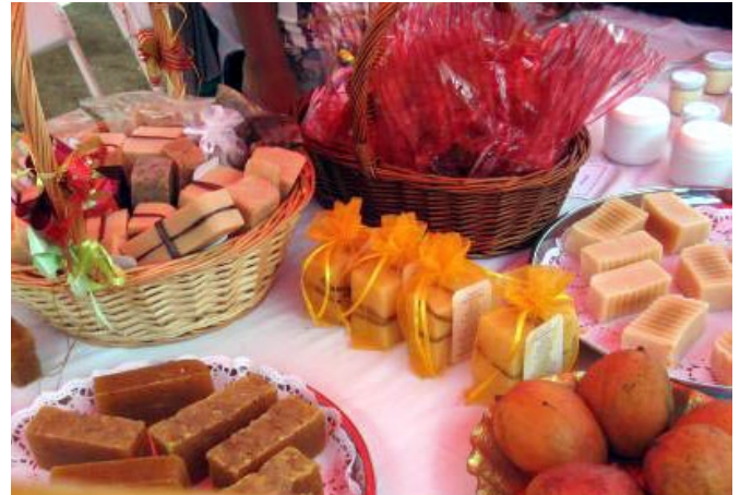
Mango products on display at the Mango Festival