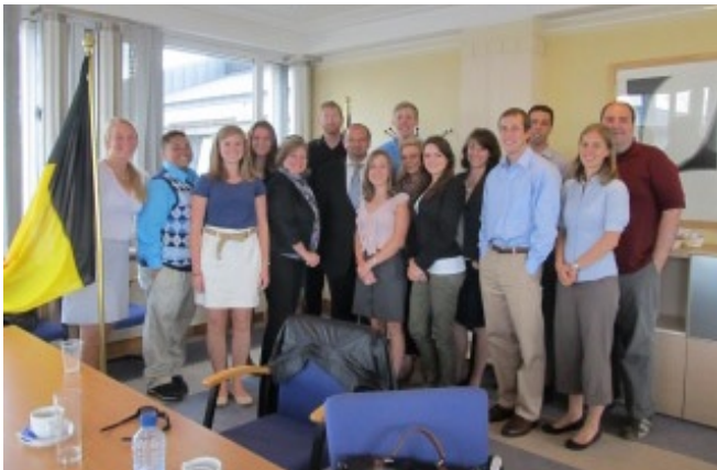
Group from Georgia Tech meeting with a representative of the Belgian Ministry of Foreign Affairs.