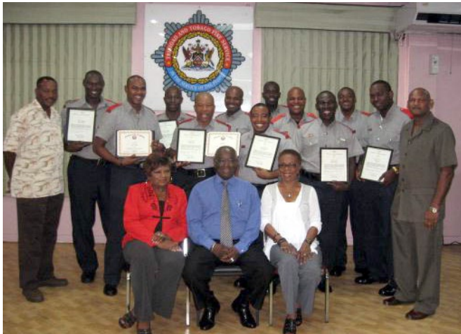
Fire officers from Trinidad and Tobago visit Atlanta for training.