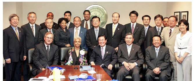
2005 Daegu delegation, visits Atlanta