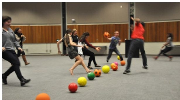
Students enjoy a game of dodgeball at North Atlanta High School