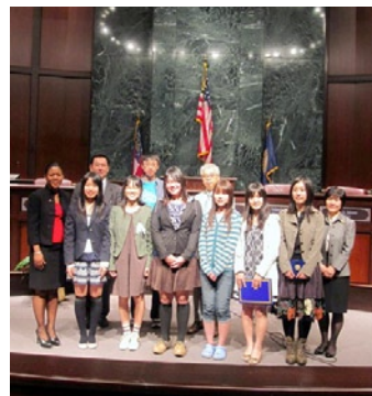
Fukuoka students visit CNN and Atlanta City Hall