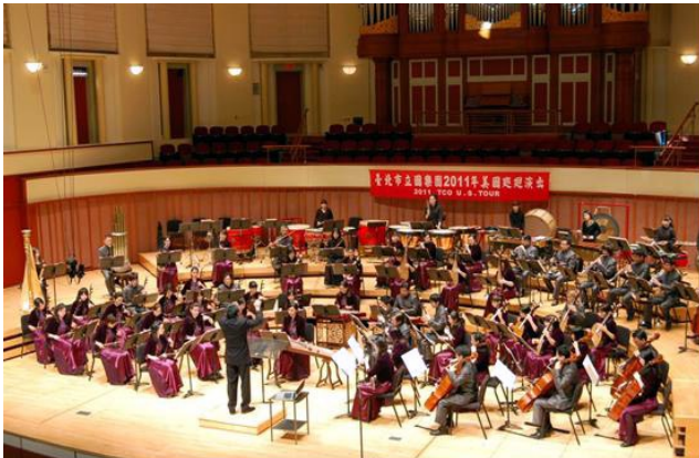
The Taipei Chinese Orchestra