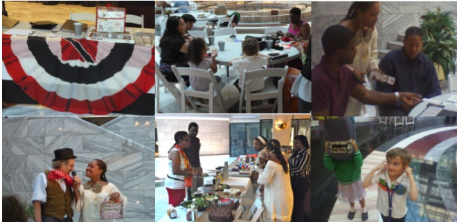
Launch of the Literacy Program Atrium of Atlanta

"You are the Sculptor, You are the Artist, create your FUTURE and become your blessing!"