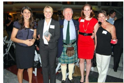
Guests at Annual Taste of Georgia event.

was a great success and once again it brought together natives of the Country of Georgia and their local friends who have been involved with their home country.