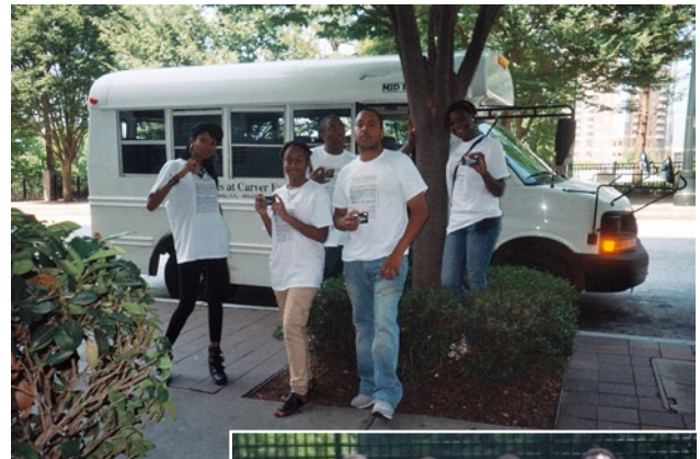
Carver YMCA teens explore photography in downtown Atlanta as part of the "Exile Project"