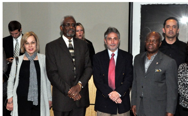
ASCC members welcome students and hosts at the Commission reception

❖ The objective of the program was to foster exchange of knowledge in practical aspects of globalization; encourage people to people connections, partnerships and joint projects; and to expose students and teachers to opportunities to work with international organizations.