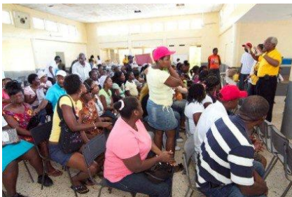
Left: At the Montego Bay Health Mission

❖ Fund Raising: The Committee held its eleventh annual fund raising golf charity tournament at the Durham Lakes Country Club. Additionally, our annual fund raising ball was held in September. Jamaica's Ambassador to the United States was the guest speaker and in her speech she strongly endorsed the activities of the Committee. As is customary, the majority of the proceeds from these events were used in conducting our Health Mission and assisted in providing needed medicines to the patients seen in Montego Bay.