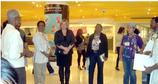
The Caribbean American Fashion Exchange

❖ In January 2011, the Committee agreed to partner with JLC Productions to launch Caribbean American Fashion Exchange. The program, a fashion marketing platform for Caribbean and Caribbean American fashion and accessory designers, seeks to bridge the gap between the fashion industries of the Caribbean and the United States by providing sales and promotion opportunities in the U.S. for Caribbean and Caribbean American designers. The Caribbean American Fashion Exchange opened in May 2011 and continued with the Atlanta Apparel Trade Show and Tales in Weaves That Bind in October 2011.