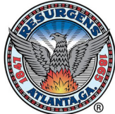
Kasim Reed Mayor of Atlanta

A handwritten signature in black ink that reads "Kasim Reed". The signature is fluid and cursive.