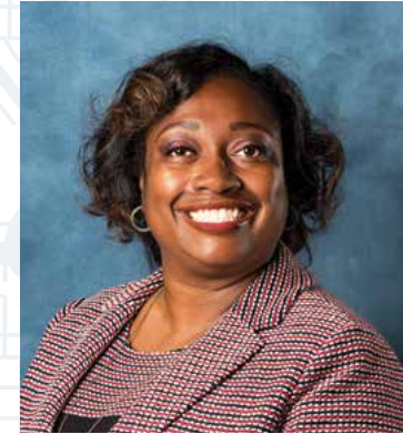
COTENA P. ALEXANDER OFFICE OF TRANSPORTATION INFRASTRUCTURE MANAGEMENT DEPUTY COMMISSIONER