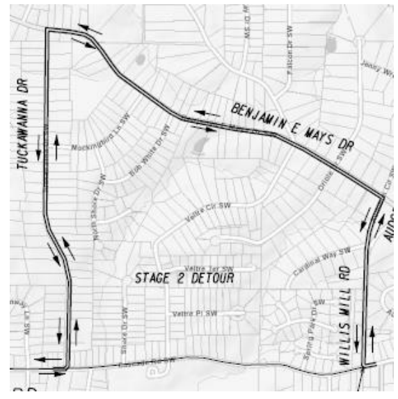
Tuckawwana Drive to Willis Mill Road