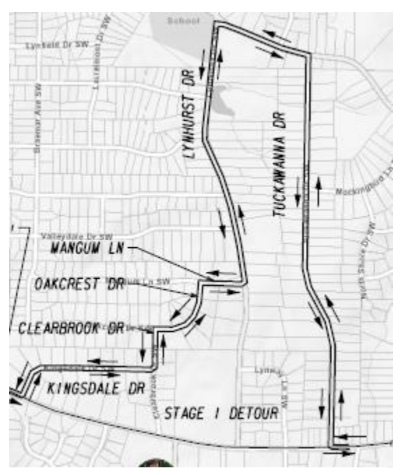
Kingsdale Drive to Tuckawwana Drive

Yes. Three (3) road closures with detours are proposed to accommodate roadway improvements throughout the project: