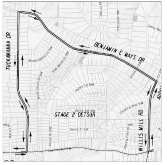
Tuckawanna Drive to Willis Mill Road