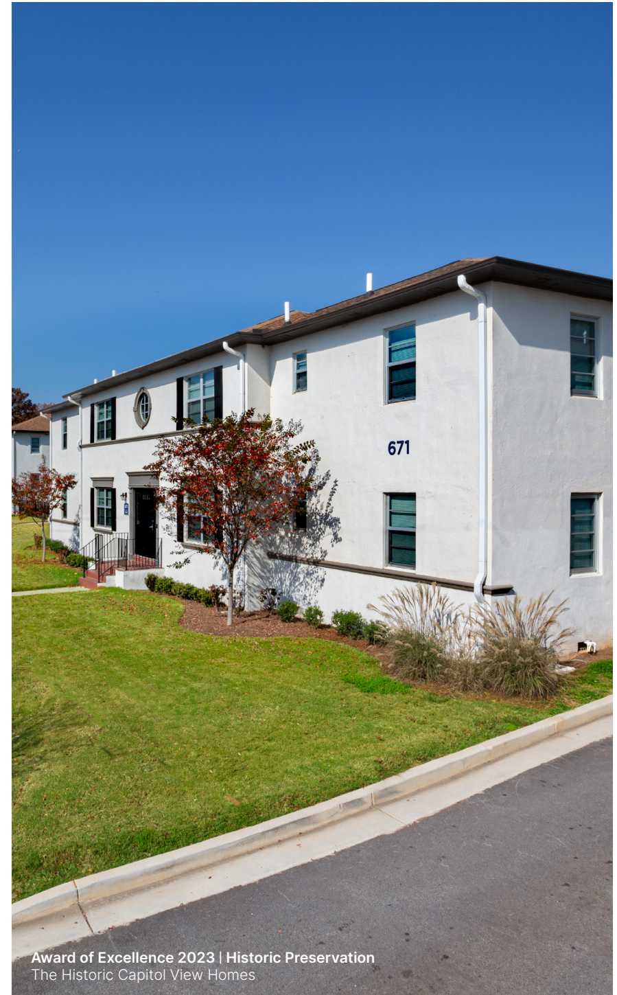
Award of Excellence 2023 | Historic Preservation The Historic Capitol View Homes

The Atlanta Urban Design Commission seeks to promote and recognize high quality design and development in the city of Atlanta through its annual design awards program. The Atlanta Urban Design Commission reviews plans and projects for historic buildings and districts in the city of Atlanta, as well as for City of Atlanta owned properties and rights of way, works of public art, and parks; all of which affect the aesthetic, cultural and historic quality of Atlanta's urban experience.