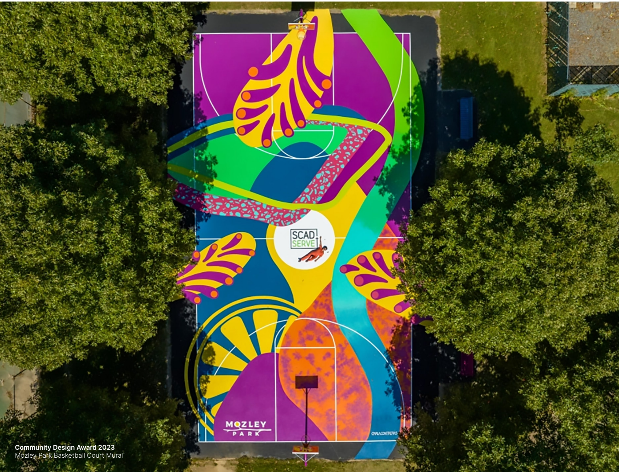
Community Design Award 2023 Mozley Park Basketball Court Mural