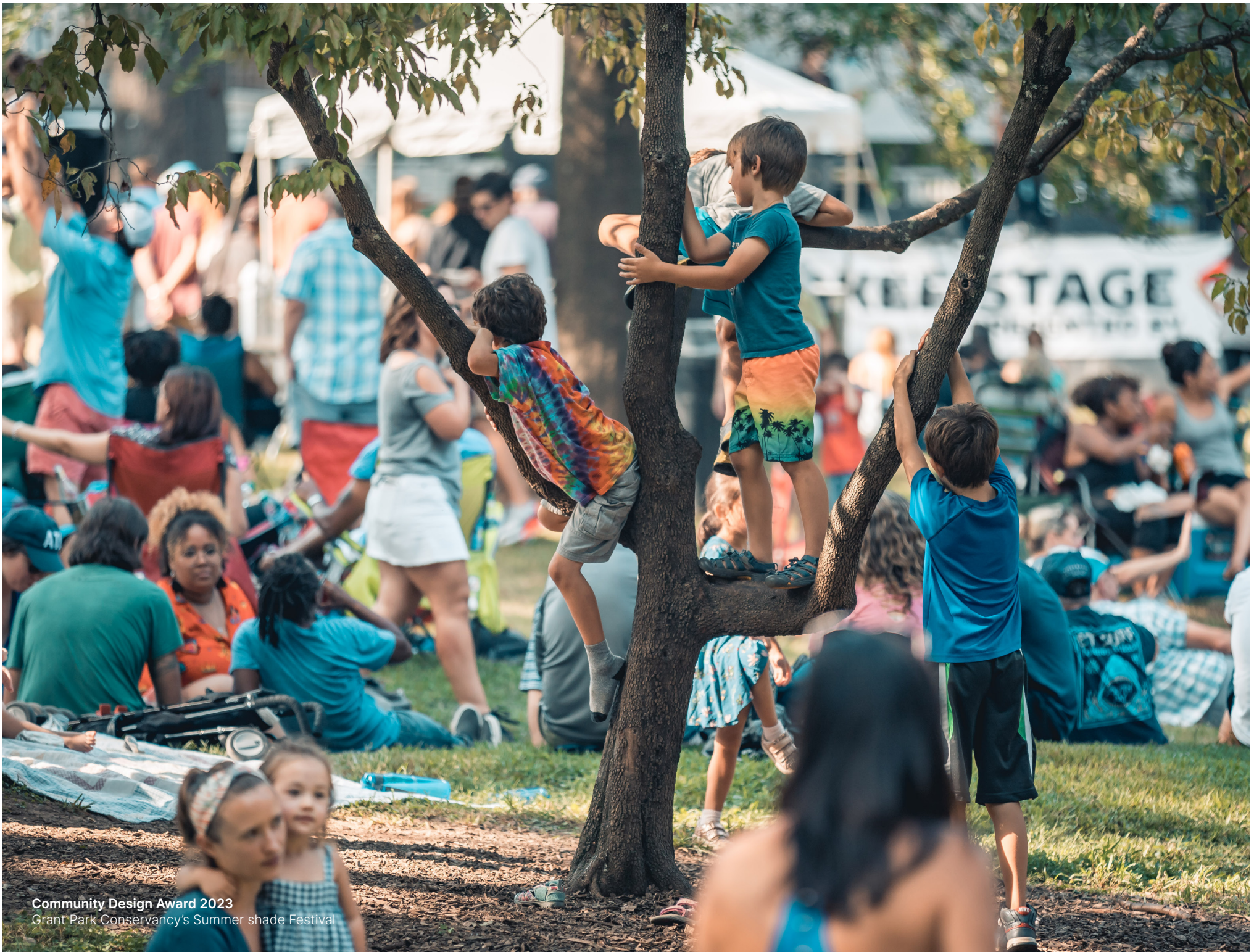
Community Design Award 2023 Grant Park Conservancy's Summer shade Festival