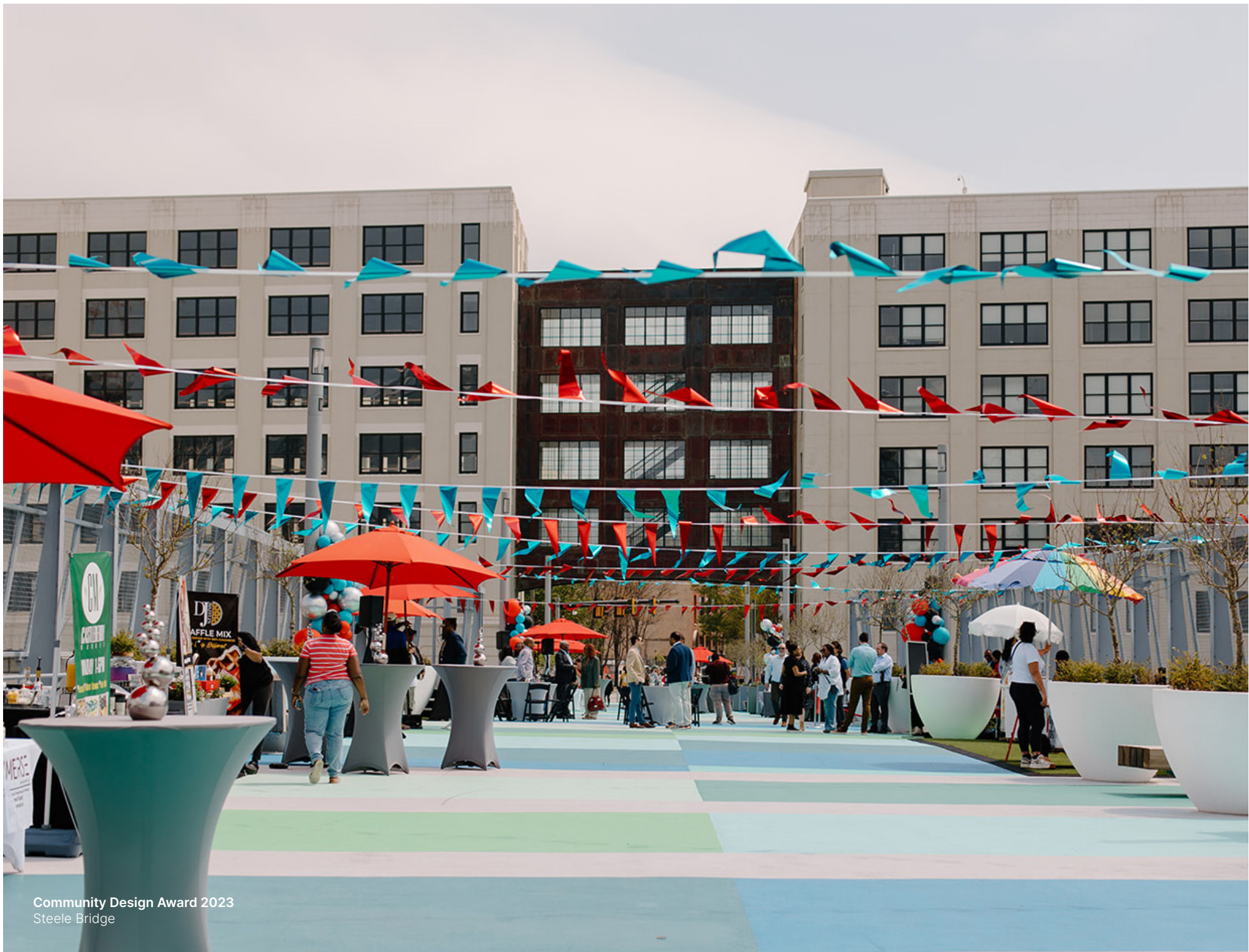
Community Design Award 2023 Steele Bridge