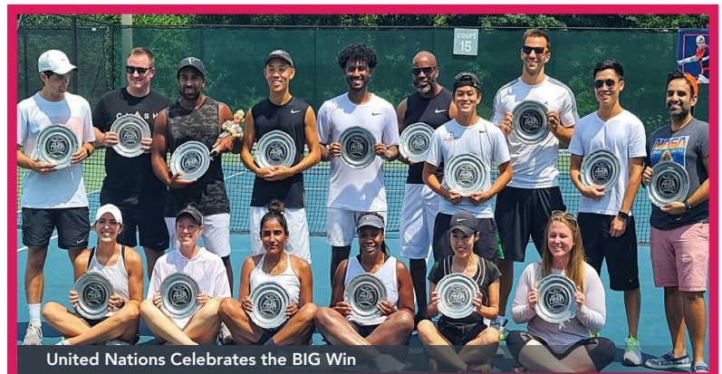
United Nations Celebrates the BIG Win