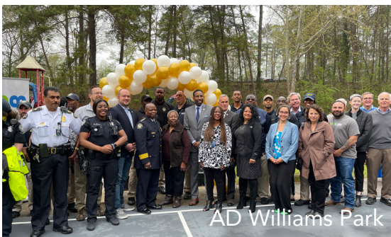
AD Williams Park