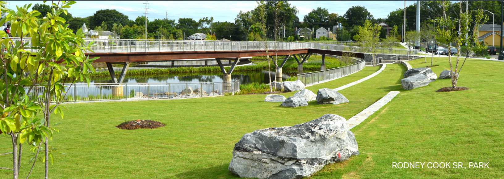
RODNEY COOK SR., PARK