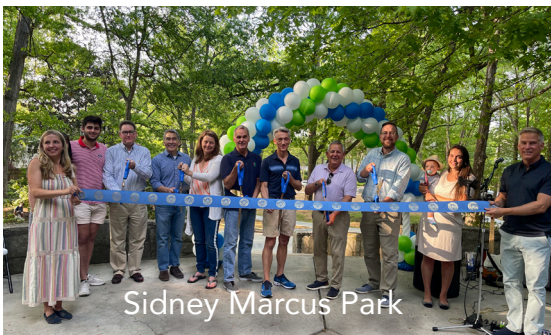
Sidney Marcus Park