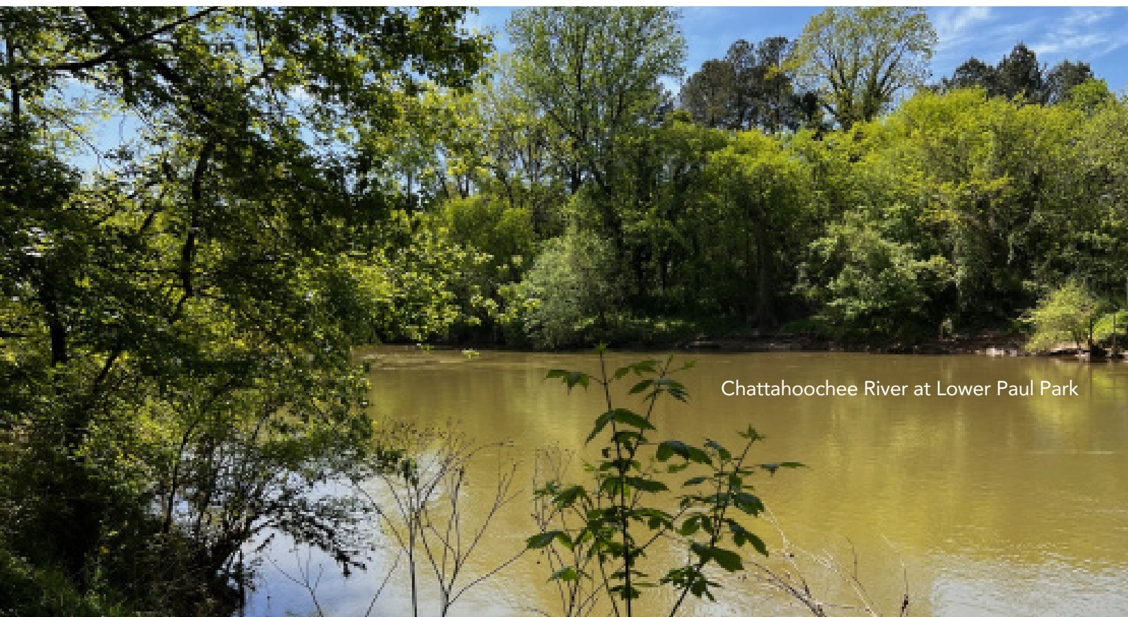
Chattahoochee River at Lower Paul Park