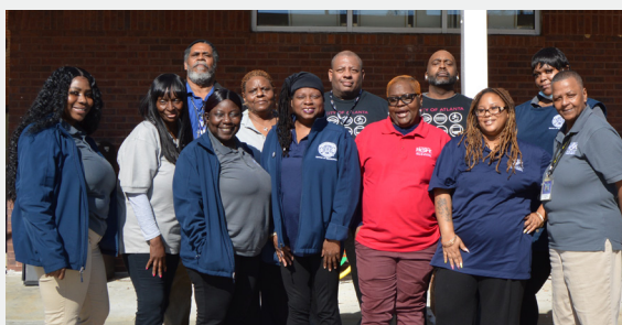
Office of Recreation Custodial Team