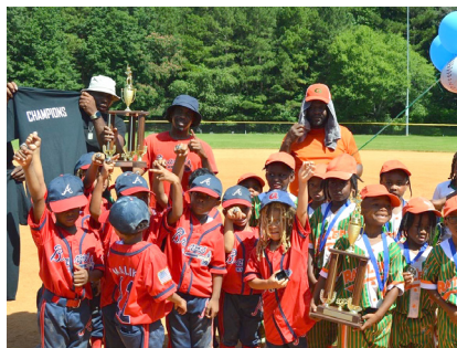
M.L. King, Jr. 6u

Games will be played at Central Park located at 400 Merritts Avenue in Atlanta. Come out and show your support for our teens!