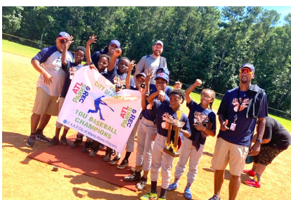
Atlanta PAL, 10u