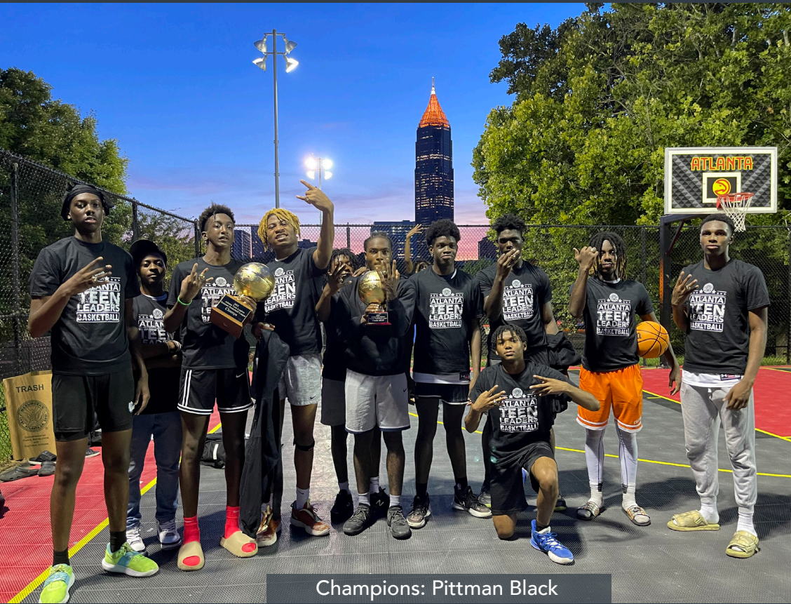
Champions: Pittman Black