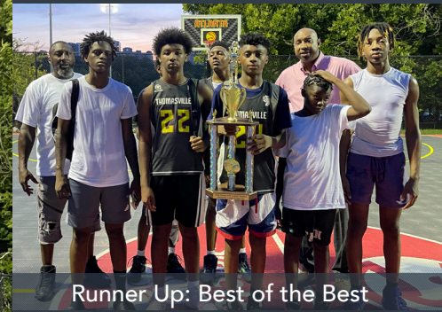
Runner Up: Best of the Best