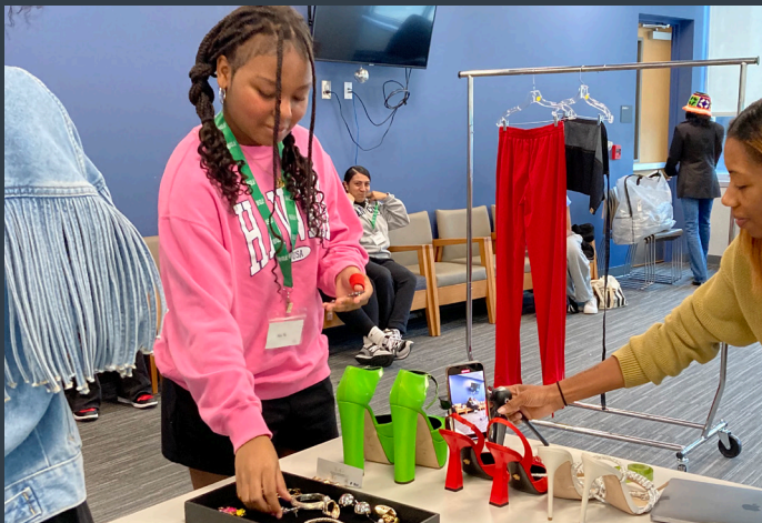
ATL Teen Leaders Girls Empowerment Summit