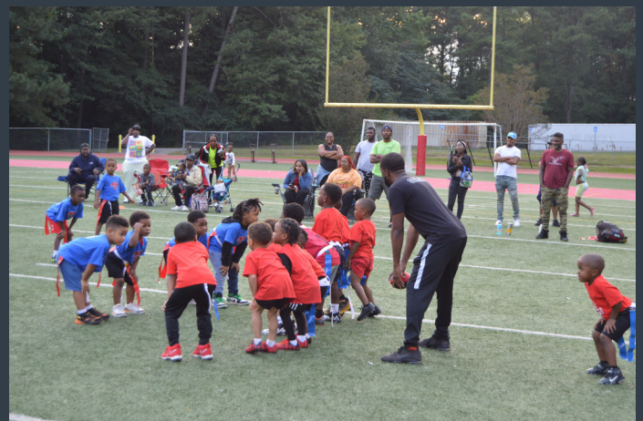
Tot Football Championship