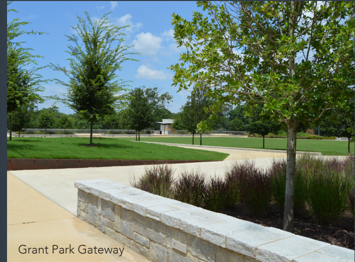
Grant Park Gateway