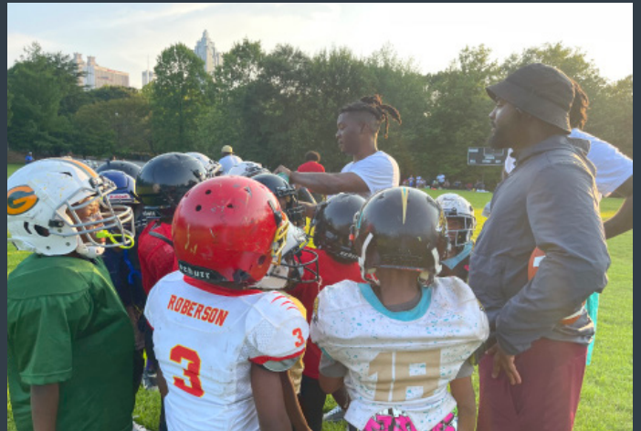
Youth Football Practice