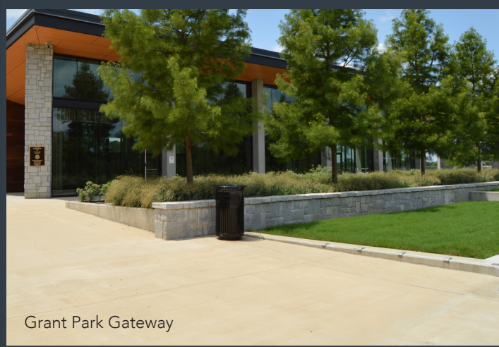
Grant Park Gateway

Westside Park, Atlanta's largest park (280 acres), provides the City of Atlanta with a major emergency water supply with its 35.5-acre quarry-turned-reservoir increasing the city's reserve from three to 30+ days. Programmatic drivers for the development of the park included accessibility, connectivity and activation. Project planning and design involved a community engagement component and a significant amount of green infrastructure, including a 100% native plant palette to restore the site. Westside Park offers one-of-a-kind elements such as a panoramic view of the city skyline, an iconic ribcage entryway, and the Birth of Atlanta sculpture (designed for the 1996 Atlanta Olympic Games).