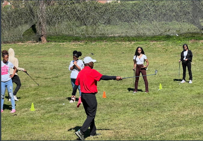
Fall Campers Try Their Hand at Golf