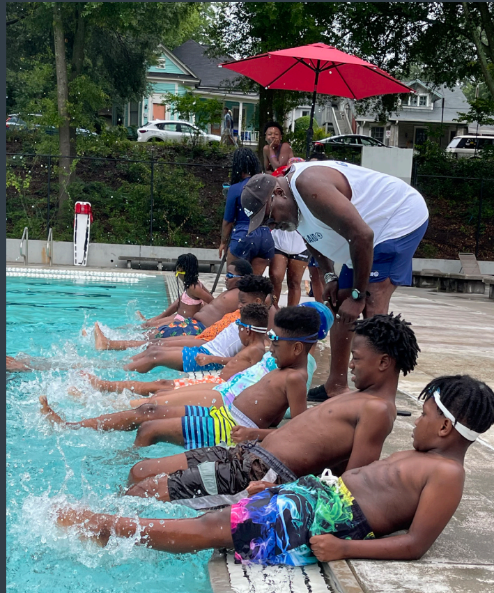
"World's Largest Swim Lesson" at Grant Park in June 2023.

The Department of Parks and Recreation, YMCA of Metro Atlanta, Children's Healthcare of Atlanta, the American Red Cross and WABE have partnered to form the Atlanta Water Safety Coalition to combat childhood drownings. The collective hosted the "World's Largest Swim Lesson" at Grant Park in June 2023. Studies show the highest drowning rates are among children ages 1-4 and boys ages 15-19. However, youth in Black and Brown communities are at greater risk overall. The coalition endeavors to develop age-appropriate strategies and create greater access to swimming and water safety instruction for Atlanta's youth, especially people of color. January 25, the organization hosted the screening of the documentary "Drowning in Silence:" one of many efforts to drive greater awareness and elevate action through prevention.