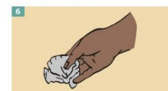
6 Dispose of the gloves safely. Do not reuse the gloves.