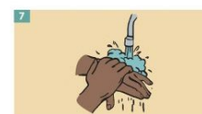
7 Clean your hands immediately after removing gloves.